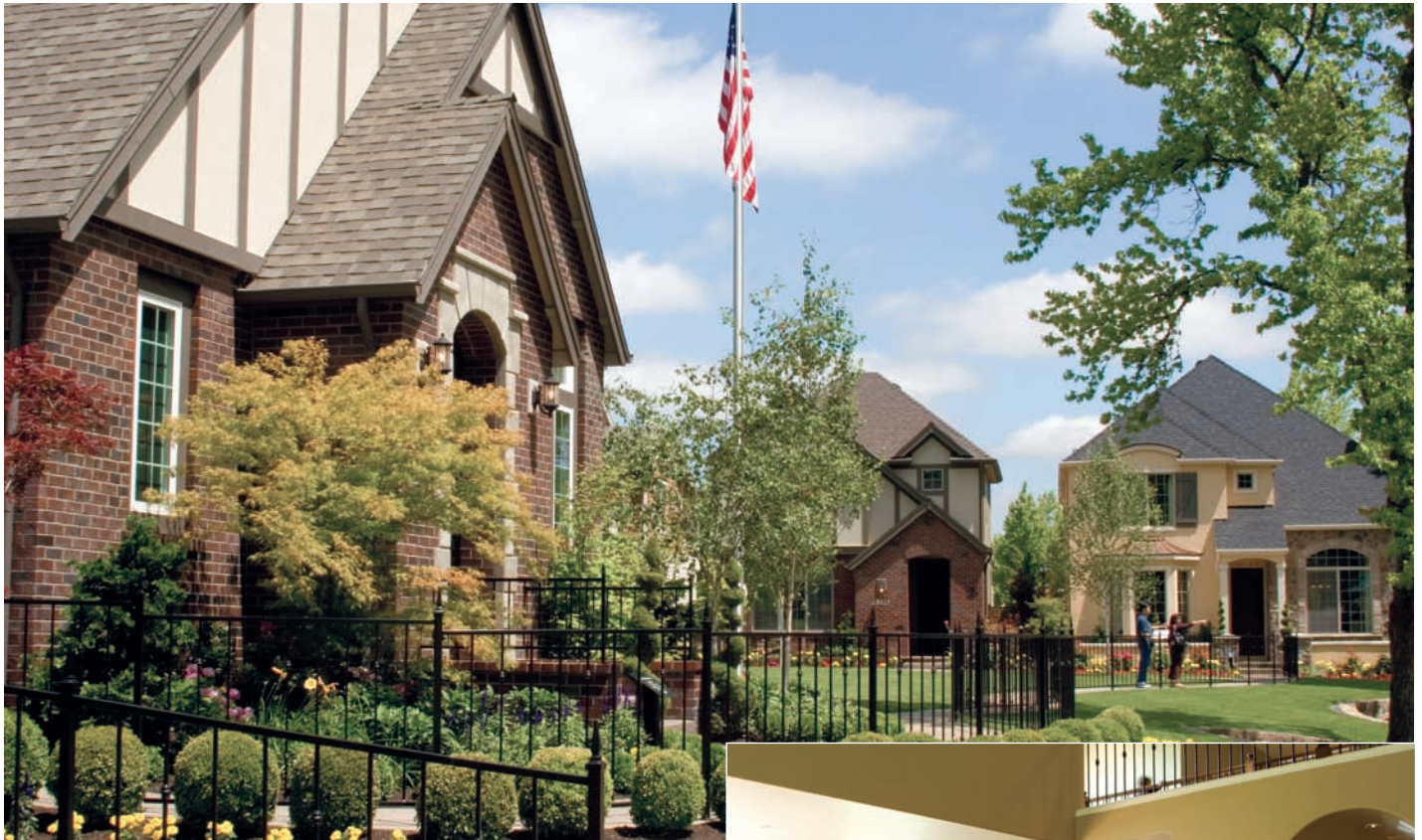
VINTAGE FLAIR: The housing at Villebois is patterned after the architecture of many of Oregon's established neighborhoods. The first of 850 homes from Arbor Custom Homes—showcasing various architectural styles—reflect the overall feel of the 500-acre project.